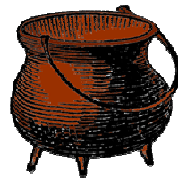
rusty old pot