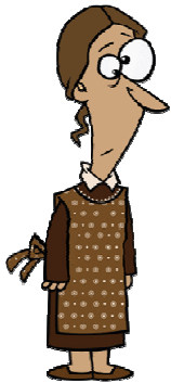
old hen wife